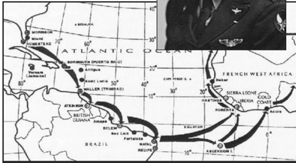
Southern flight route to England

1st Lt. Platt and 635 arrived just in time to fly Mission Hackensack in Operation Overlord on 7 June 1944. They towed a glider to the 82nd Airborne at St. Mere Eglise, France.