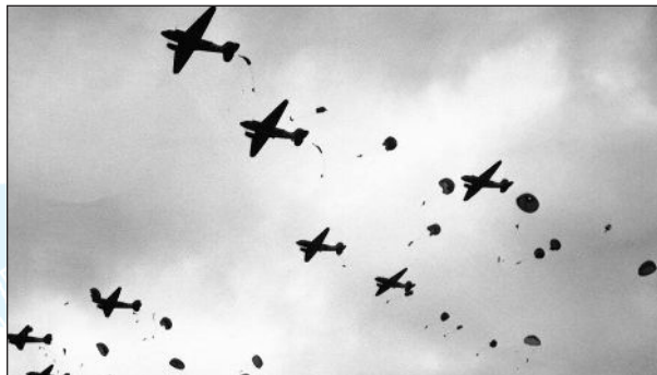
Paratroopers jumping from C-47 Skytrains