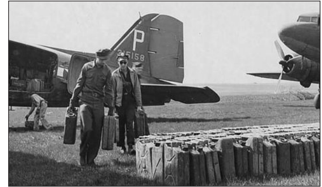
Delivering "jerrycans" of fuel for military vehicles