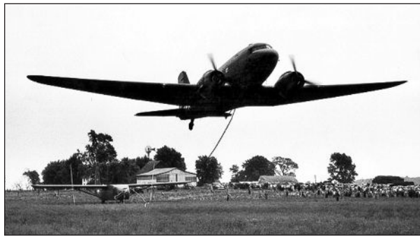
C-47 takes off with glider hitched ready for a tow

1st Lt. Platt flew 635 in Operation Market Garden and was nearly shot down over Bastogne, Belgium, during the Battle of the Bulge. The 635 and crew flew as a weather observer for Operation Varsity, 24 May, 1945, continuing on with its work.