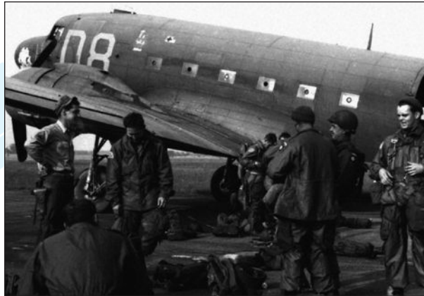
Paratroopers preparing to board