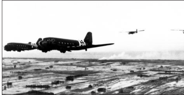
Airborne C-47s towing troop gliders – D-Day 1944