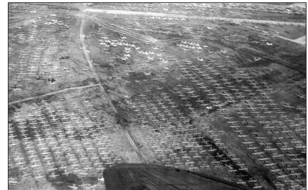
Ariel view of surplus planes "boneyard"