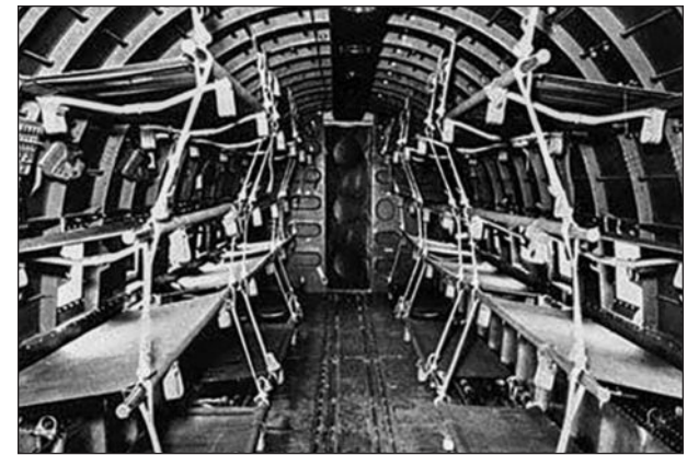
C-47 interior outfitted for medical evacuation